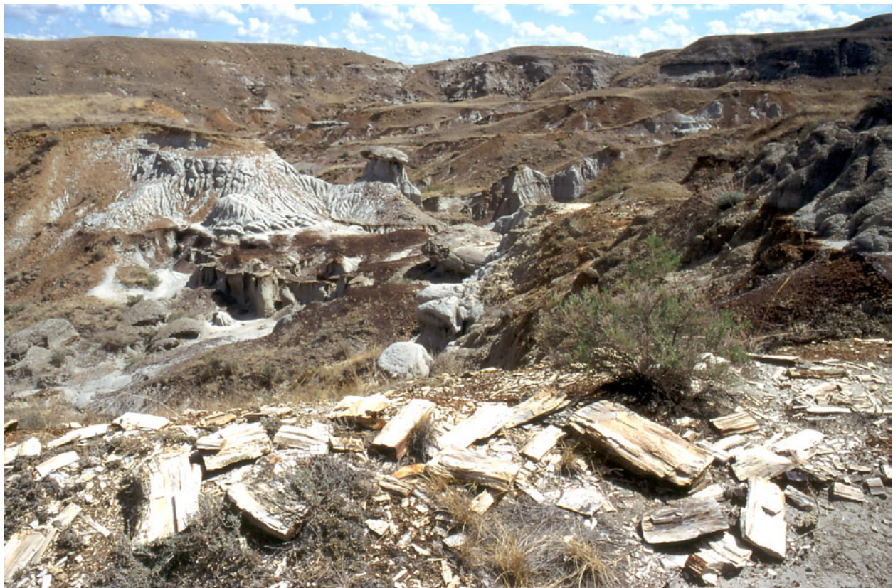
Figure 5. Fossil wood, probably from a giant conifer, in the Dinosaur Park Formation, Wolf Coulee, Dinosaur Provincial Park.

The formation and group names discussed previously are essentially defined by these changes in sediment deposition. For example, about 80 million years ago, most of Alberta lay under the Western Interior Seaway, which accumulated large volumes of marine mud, known today as the Lea Park Formation in northern and central Alberta and the Pakowki Formation (and portions of the Foremost Formation) in the south. As time passed, the sea slowly retreated and terrestrial sedi-