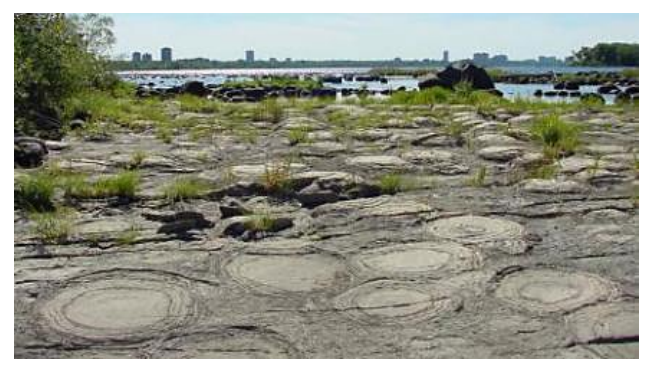
Figure 3. Ordovician stromatolites. Ottawa skyline is seen on the horizon.

Great Slave Lake is the deepest lake in North America with a maximum depth of 614 m (2,014 ft). The East Arm of Great Slave Lake has been described as a world-class scenic and geological wonder. This area consists of deep channels and bays extending some 240 km into the Precambrian Shield. The subsurface consists of an aulacogen containing unmetamorphosed Precambrian (Early Proterozoic) sandstones, conglomerates, gabbro sills and stromatolite-bearing limestones. The limestones are 175