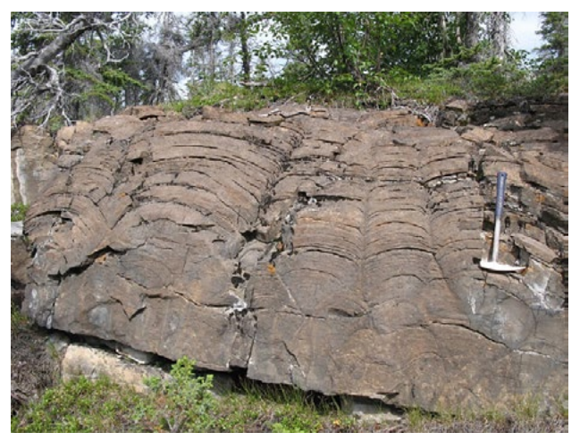
Figure 1. Precambrian stromatolites outcropping in East Arm of Great Slave Lake.

The author of this presentation was first exposed to outcrops of Precambrian stromatolites in the summer of 1971 while working on a mining exploration program in the East Arm of Great Slave Lake, Northwest Territories. The stromatolites have been dated at 1.8 billion years old. This left him with an abiding interest in stromatolites. In 2005 while working in Angola, West Africa he visited 1.1 billion-years-old Precambrian stromatolites in the interior of the country. In the fall of 2018, he studied Ordovician stromatolites that outcrop in Gatineau, Quebec, along the northwest shore of the Ottawa River, directly across from Ottawa. This presentation is based on those observations and also reviews some select global occurrences of stromatolites.