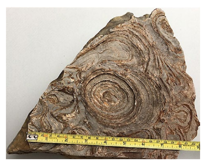
Figure 2. Precambrian stromatolite from near Meridian Lake, East Arm of Great Slave Lake. Diameter 11 cm.

Stromatolites (strom = layer, lithos = rock) are layered mounds, columns and sheets of rock built through microbial activity. Cyanobacteria, which are single celled organisms, formed slimy, gelatinous algal mats on the shallow seafloor or on the floors of saline lakes such as Great Salt Lake in Utah. These mats built upwards layer by layer by the trapping and binding of sediments in their sticky slime. This resulted in structures ranging in size from a couple of centimetres to more than 10 m across. Indeed, in the Belcher Islands, eastern Hudson Bay, middle Precambrian, 1.8 billion-years-old stromatolites form bioherms that are tens of metres in size.