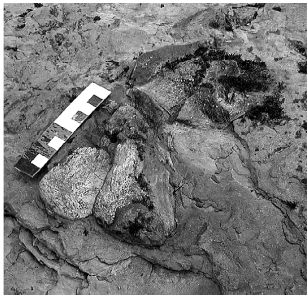
Dinosaur bones embedded in the trackway bedding surface.