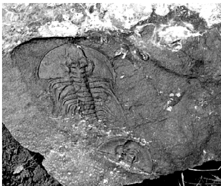
Olenellus sp. (Lower Cambrian) from Fort Steele.

The remainder of Saturday morning was spent driving along the Bull River from Fort Steele to a fossil site directly on the roadside, easily reached on foot with no climbing involved.