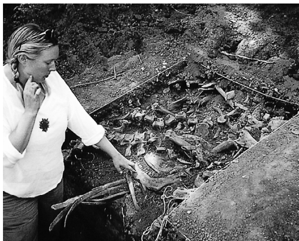
Bison kill bone bed exposed in an excavation at Fish Creek Park.