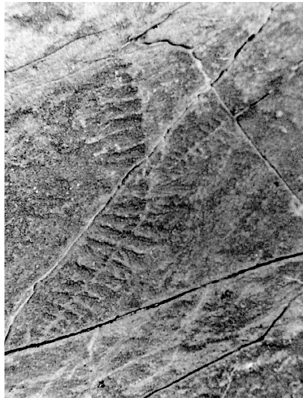
Ptendinium? at Mistaken Point, Newfoundland.