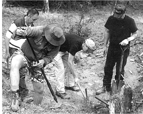
APS members demonstrating their sincerity at the Fort Steele trilobite beds. Put your backs into it, men!

mens had to be pried loose from the surrounding rock. This richly fossiliferous outcrop is part of the marine, late Middle Devonian Harrogate Formation with mainly brachiopods such as Atrypa and Emanuella ; also corals including Favosites and Alveolites . There was also one gastropod found.