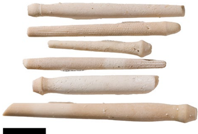
APS.1989.16 (scale bar = 1 cm)

T his installment is a space-filler, so strictly bare-bones—so to speak! Four more random specimens from the APS collection.