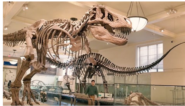
edX promotional video image.