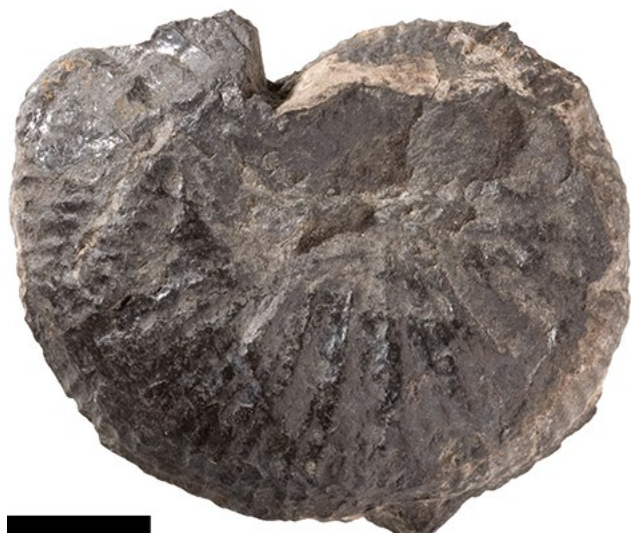
APS.1989.07 (scale bar = 1 cm)

T hese rod-shaped objects are echinoid (sea-urchin) spines from the Miocene of the Batesford limestone quarry, near Geelong, Victoria, Australia (see sponge specimens 1999.22 featured in the March 2017 Bulletin ). Donated by Leslie Adler .