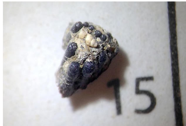
Cluster of fish teeth (black, peg-shaped) surrounding a small snail shell, from "Sheeps Ahoy" matrix. Width of view approx. 8 mm.