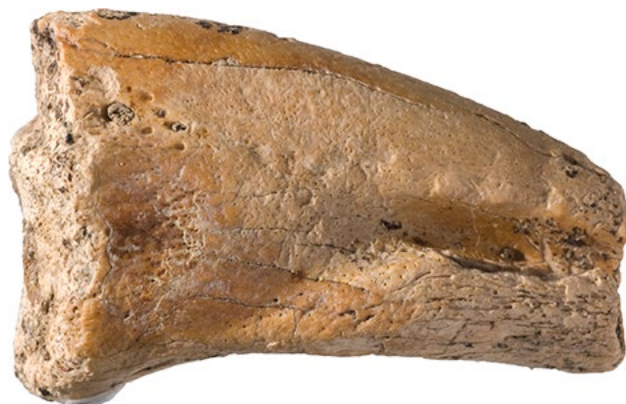
APS.2006.02 (scale bar = 1 cm)