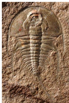
Olenellus sp. from the Lower Cambrian Eager Fm.