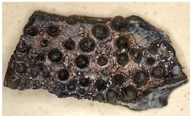
Coriops fish tooth plate, Scollard Formation. Specimen is less than 10 mm in length.

During the four 2.5 hour sessions on January 17, January 31, February 14 and February 28, Dr. Donald Brinkman of the Royal Tyrrell Museum brought