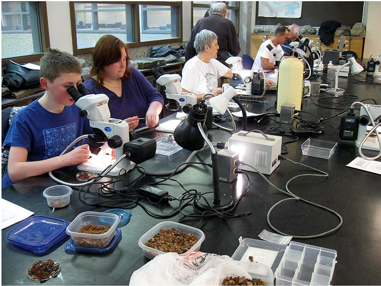
Sorting amber specimens (containers in foreground) for fossil inclusions.

of Alberta, described his adventures in New Brunswick, searching for early Devonian fish.