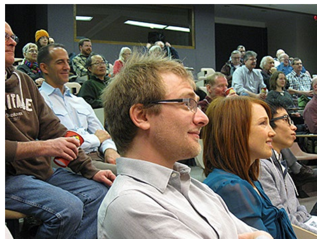
Audience enjoys a symposium talk in Jenkins Theatre.