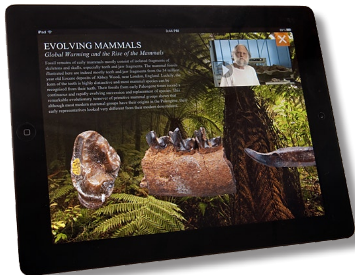
Figure 3. An example from the Events button on “Evolving Mammals”. The video of a scientist speaking about the event is available by tapping on the play button in the upper right.

Another part of this extensive app is a scrollable series of seventeen Timeline Events from the origin of life to the origin of human art. Most of these events have an audio component so that you can listen to a commentary on the event (Figure 3). There is a possible glitch here, because if you stop a narration for one event and move to another and click the audio button on the new event, the narration from the previous event continues. If you wait a while, the right narration becomes active. The message is that you should listen to the whole narrative—not a bad lesson for the fast and fickle fingers of iPad users. On many of these event pages there are featured videos with scientists from the Natural History Museum describing the event.