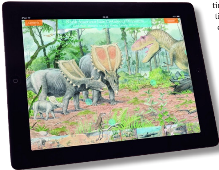
Figure 2. An example of the elegant art work on the Timeband showing Late Cretaceous dinosaurs; there are about 100 different illustrations like this one displayed continuously along the Timeband. Tapping on the screen reveals blue dots that can be tapped to get details on the organism next to the dot. The lower band on the screen allows for more rapid scrolling to specific parts of the Timeband.

for the Ediacaran, the Burgess Shale for Cambrian diversification, Miguasha and Ellesmere Island for the emergence of tetrapods in the Devonian, Joggins for its Carboniferous fossil plants and first reptiles and the Cretaceous dinosaurs of Alberta (Figure 2). The great aspect of the Timeband is that you can scroll through it at your leisure tapping blue dots to gain new information and it is a truly enormous amount of information on many of the world's greatest fossil localities. If you want to find something quickly, there is a smaller scrolling bar at the bottom of the screen that allows you to scroll more quickly to individual stories.