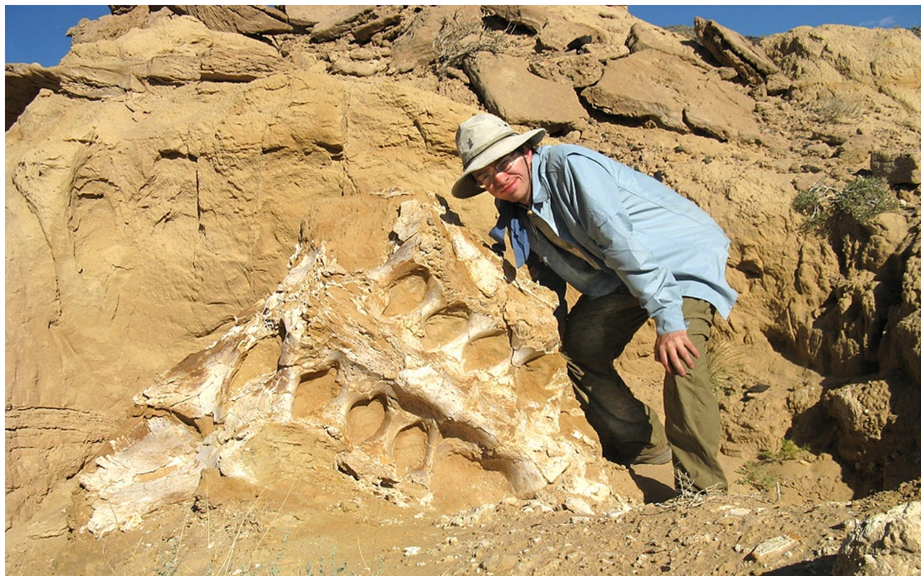
A spectacular specimen found in the Gobi Desert, Mongolia.