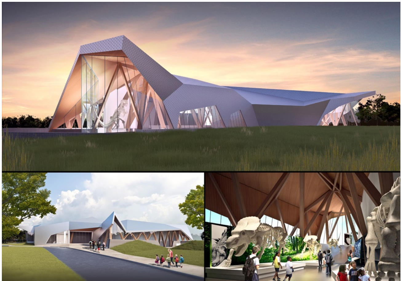
Artists' renderings of the proposed Philip J. Currie Dinosaur Museum.