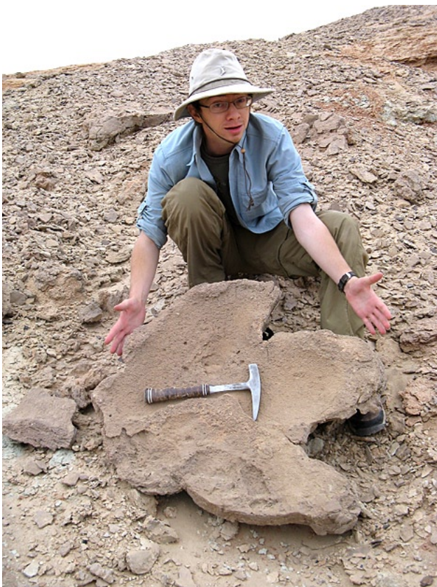
Dinosaur footprint natural cast in the field.