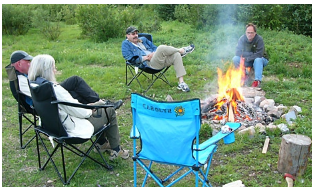
Figure 8. Field trippers enjoy a campfire at Kisoo Pass.

The following morning all returned to Kisoo Pass and once again joined the caravan now pushing even further south, arriving just short of the US border with Montana. Our destination was Couldrey Creek,