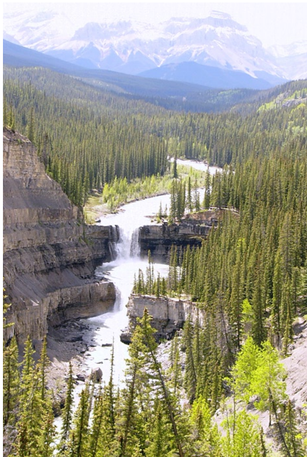
Figure 1. Crescent Falls on a beautiful June day.

O n the weekend of June 21–22, a strong contingent of APS members met at Nordegg, Alberta to investigate a number of marine invertebrate fossil localities. Yours truly was fashionably late and managed to miss the first couple of stops just to the east of Nordegg, along Highway 11. An outcrop off the beaten path exposing the organic-rich black shales