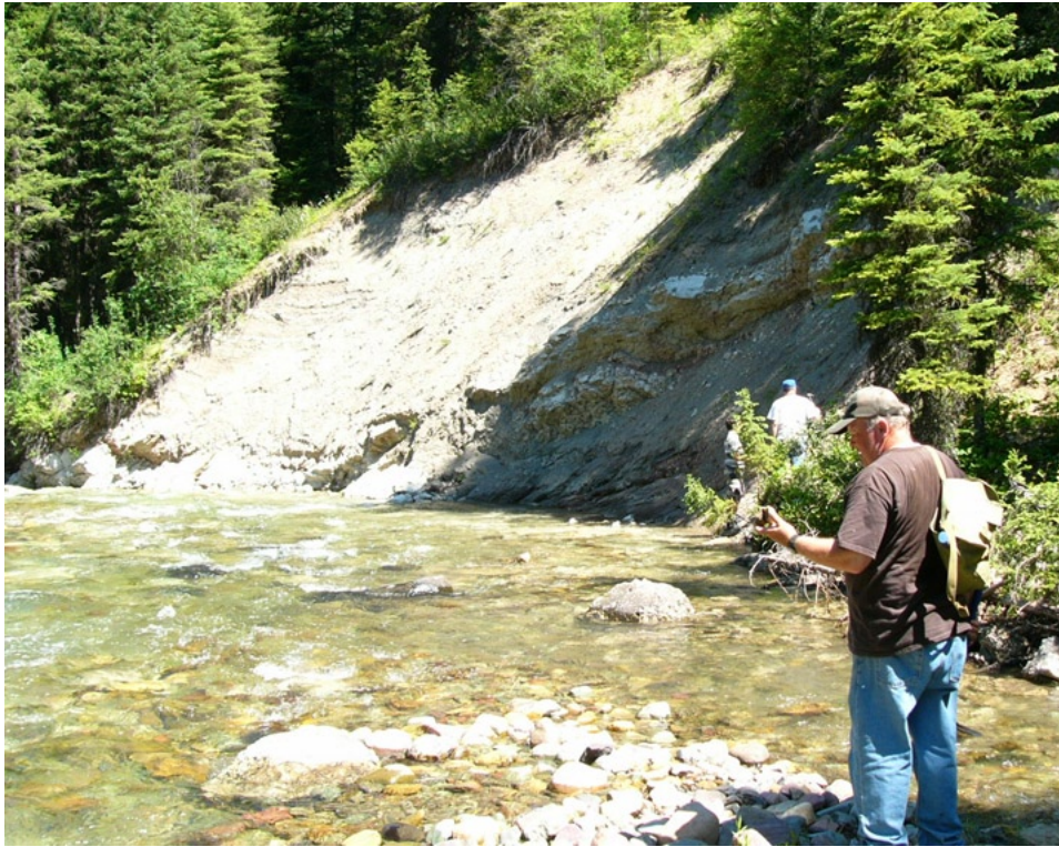
Figure 10. Outcrop of the Kishenehn Formation on Couldrey Creek.

leaving a long stretch of cutbank hidden in the forest. We all decided that a return trip was needed to explore the cutbank in hopes of finding the elusive mammal fossils we had been searching for. Watch for a future APS trip!