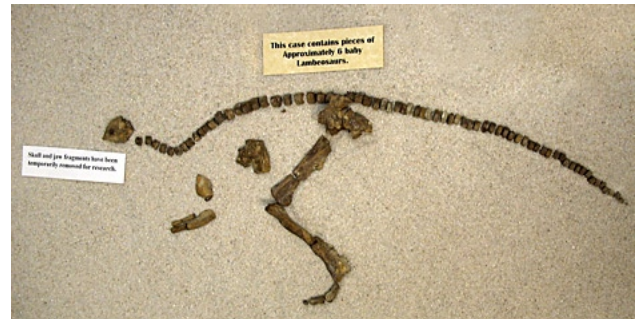
Baby lambeosaur "Ducky," a composite of bones from at least six individuals.

At the H. Earl Clack Museum in Havre we were treated to many displays specializing in embryonic or infant dinosaurs including "Ducky," the infant lambeosaur. At the time, the skull and jaw portions had been removed for research.