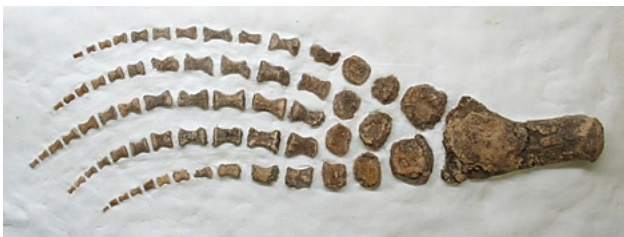
Plesiosaur flipper in the Blaine County Museum.

you as you enter the Museum of the Rockies in Bozeman. Featured in this museum were fantastic specimens of Tyrannosaurus and Edmontosaurus to name a few. The gift shop was very well stocked with many books and palaeo-related videos as well. This is a stop you must make on the Dinosaur Trail.