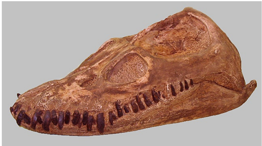
Skull cast of a plesiosaur, Alzadasaurus (Upper Cretaceous), Blaine County Museum.

“Big Mike,” a big metal tyrannosaur model, greets