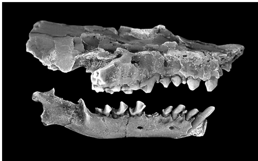
Skull and lower jaw of Pararyctes pattersoni, a late Paleocene insectivoran from the Paskapoo Formation of Alberta.

The Calgary Rock and Lapidary Club Gem, Mineral & Fossil Show, “A Hobby for All Ages,” was held at the West Hillhurst Arena Saturday and Sunday, May 3 and 4. The APS provided activities for children which were very well received. We will keep the same focus next year.