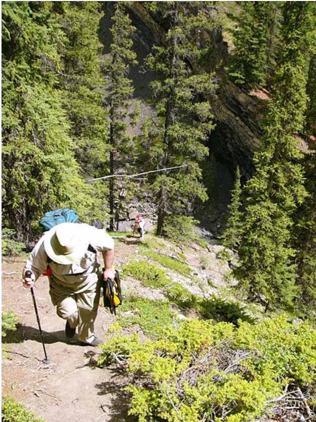
Figure 3. The steep trail down to—and more notably up from —the Bighorn River canyon.

sandy lenses are thought to be northern equivalents of the better-known “Ostracod” marker beds of the Lower Mannville/Blairmore Group of the southern Alberta subsurface. The steep climb out certainly got everyone’s heart pumping, allowing for many opportunities to stop, rest and enjoy the stellar views. Although the weather was sunny and warm, snow still clung to shady notches within the canyon, sometimes forming wonderful ice falls.