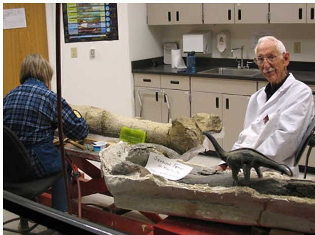
Lab technicians at the Museum of the Rockies in Bozeman prep a sauropod bone.