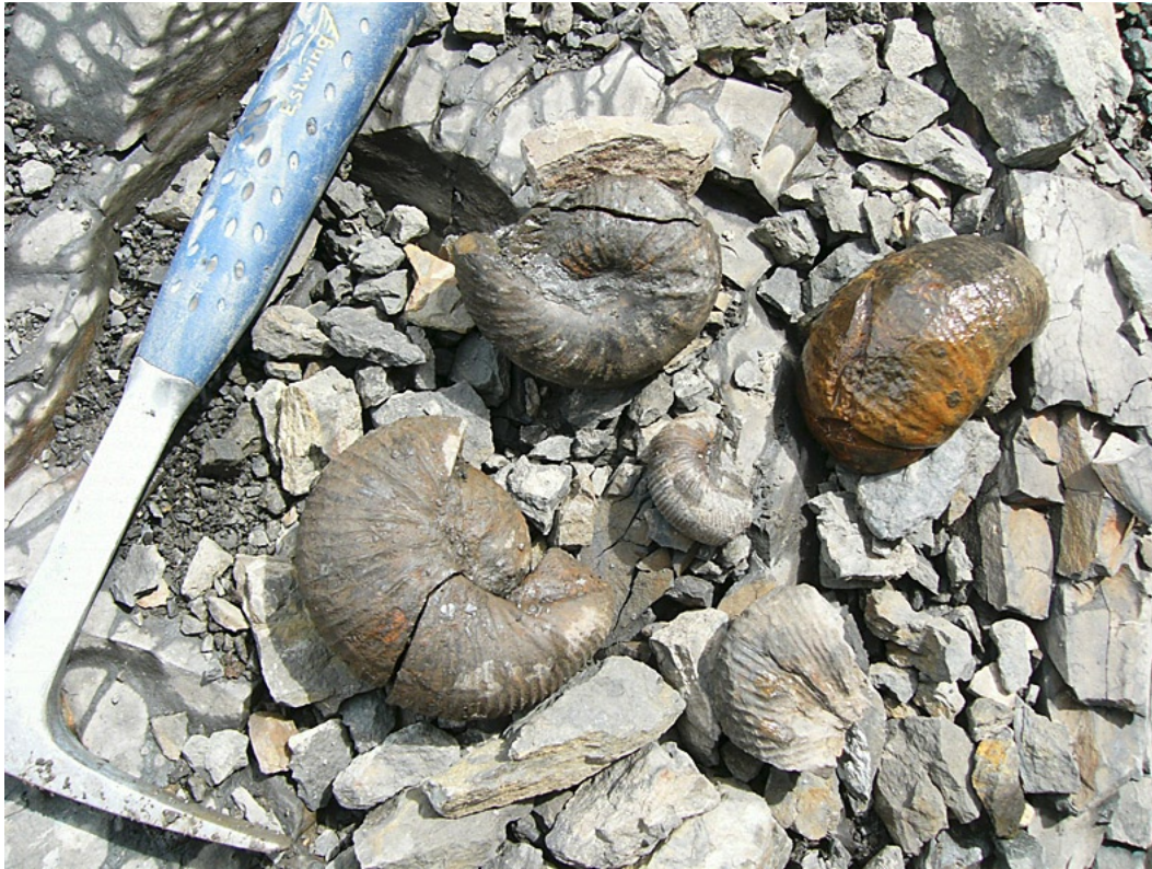
Figure 5. Specimens of the Late Cretaceous ammonite Scaphites sp. from the Wapiabi Formation.

ther south (on the return trip to Calgary) at Cripple Creek, along the Forestry Trunk Road. As luck would have it the rain had stopped prior to our arrival, but the creek was running high. A few Scaphites and Inoceramus were discovered by the group (Figure 5).