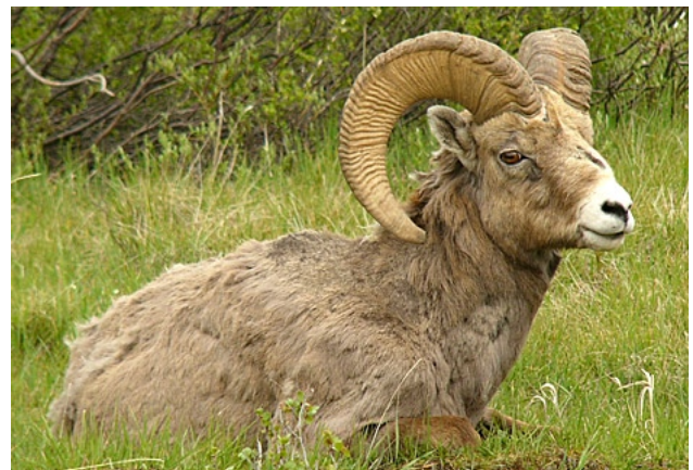
Figure 6. The cute and the majestic put in appearances at the aptly named Ram Falls.