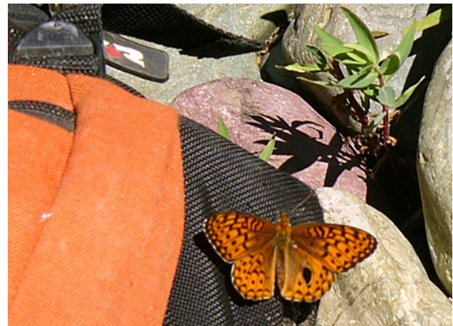
Figure 9. An orange butterfly finds something in common with Keith's backpack.

made. Our subsequent bushwhacking downstream confirmed our suspicion as we found one of the key outcrops (Figure 10). This one contained a layer with