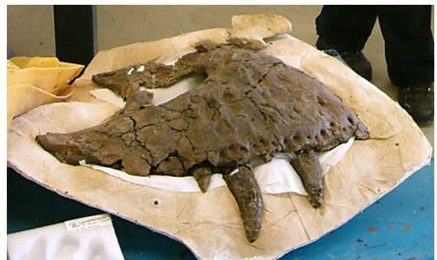
Figure 11. Scotty’s predeatary being packed for shipment.