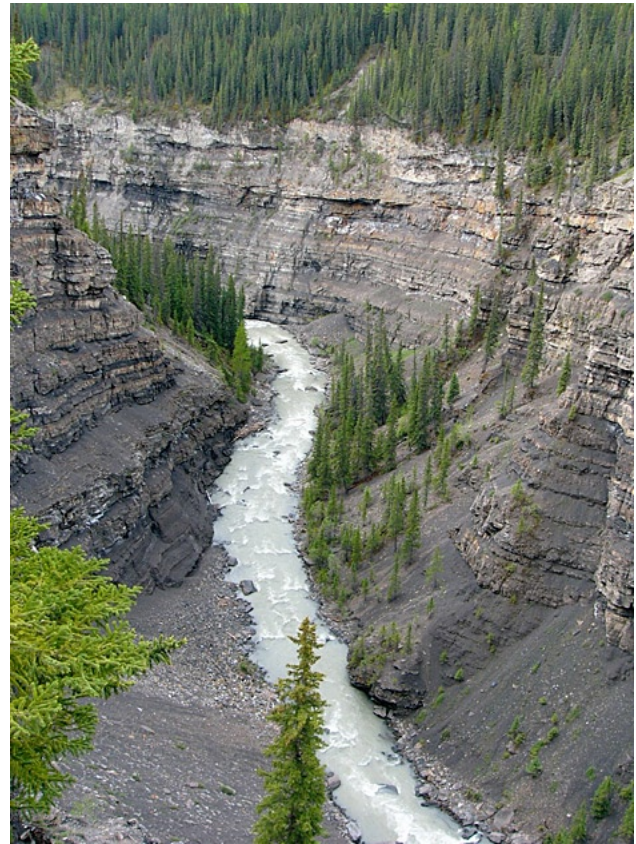
Figure 2. Canyon of the Bighorn River below Crescent Falls, exposes rocks of the Lower Cretaceous Luscar Group.

of the Lower Carboniferous Exshaw Formation was reviewed, while a road-cut along Highway 11 yielded many excellent brachiopods. The brachiopods represented a number of families including productids and spiriferids, up to 5 cm in width. They were found weathering out of their Upper Devonian limestone host rock (Costigan Member, Palliser Formation) and could be exposed by splitting the talus along the