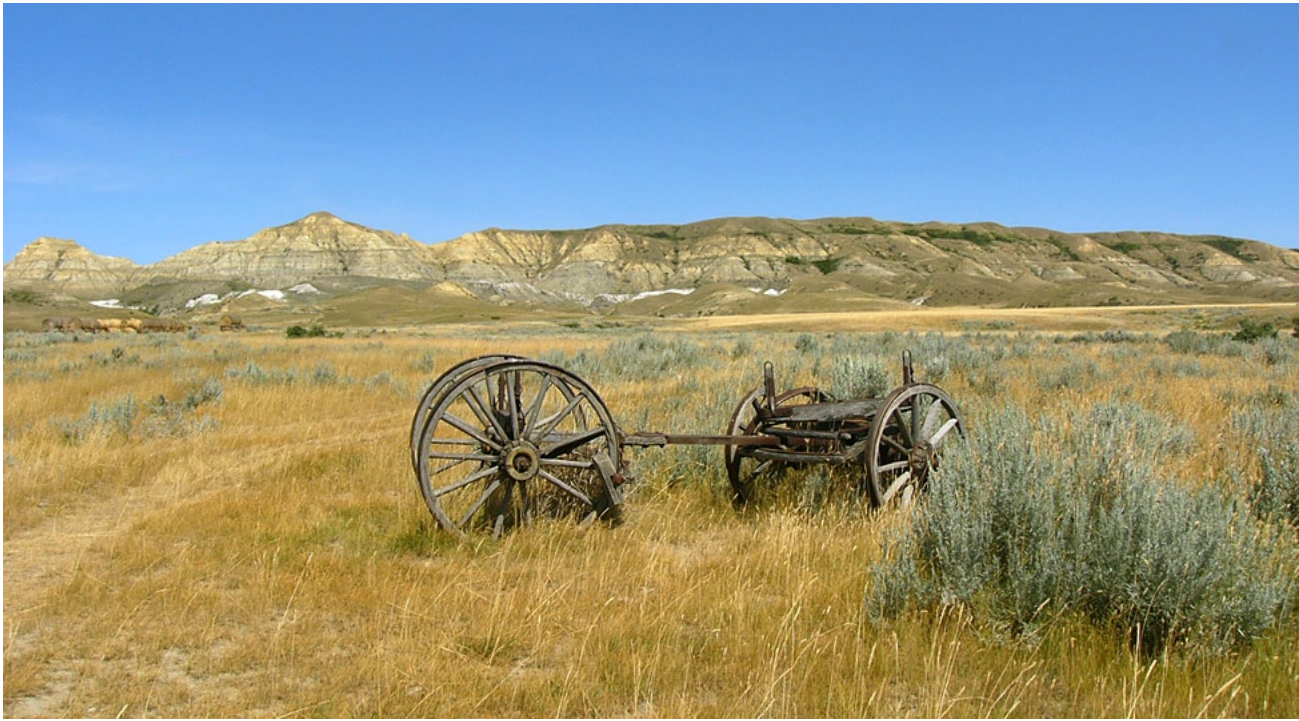
Figure 12. Prairie scenery near Eastend, Saskatchewan. The white patches at the base of the badlands are exposures of kaolin clay in the Whitemud Formation—definitely not snow!

as a source of clay for bricks and pottery. The mining process has exposed other rock units, many fossil-bearing, in the same areas. In particular, a wonderfully diverse flora, from the earliest Tertiary, is known from the area. Although Saskatchewan law prohibited us from collecting any plant remains the group was able to observe and photograph many leaf imprints scattered throughout the clay pit tailings.