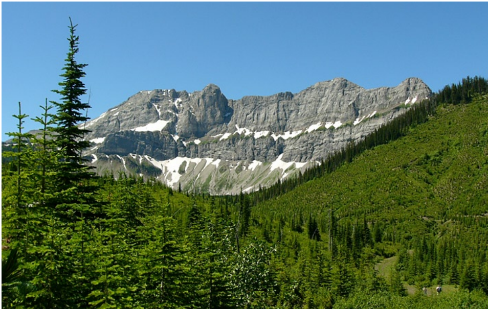
Figure 7. Westward view of the Macdonald Range from Kisoo Pass.

at Kisoo Pass (Figure 7). After much debate by our fearless leaders about our route we finally chose an abandoned logging road and began hiking up our selected mountain (wild mini-strawberries were a refreshing snack along the way). Although outcrop was rare and usually only exposed by overgrown road cuts, we found tantalizing evidence of exceptional marine invertebrate fossils. Nice three-dimensional Scaphites ammonites and Inoceramus bivalves were found by most but were very rare and seemed to only occur in patches. This area is worthy of much more exploration. Unfortunately our time on the mountain came to an end and most of us were scattered widely across it but all managed to return safely. Below the mountain several of us decided to camp for the night (Figure 8) while others returned to Fernie.