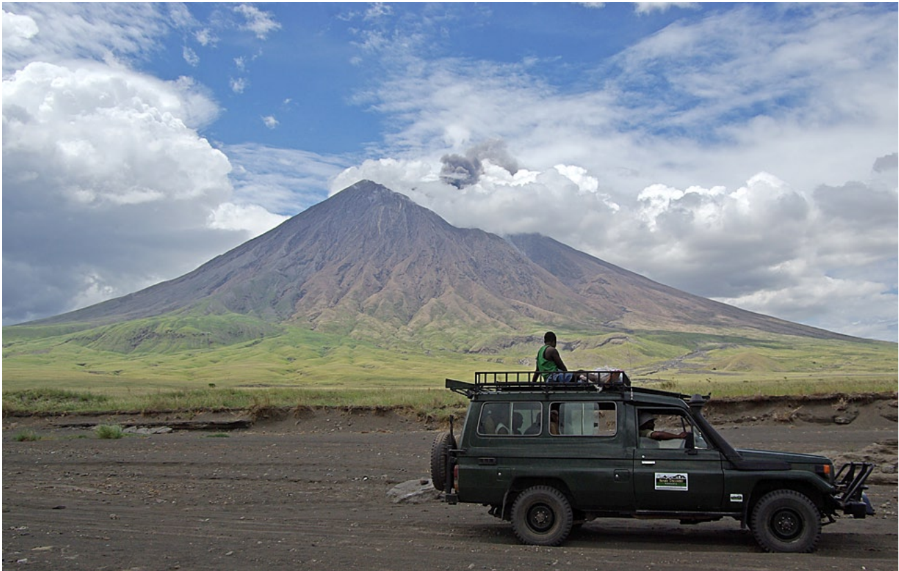
Cloud shrouded Ol Doinyo Lengai, in East Africa's Great Rift Valley, erupts in the background as the expedition crew takes one last look before returning to base camp.