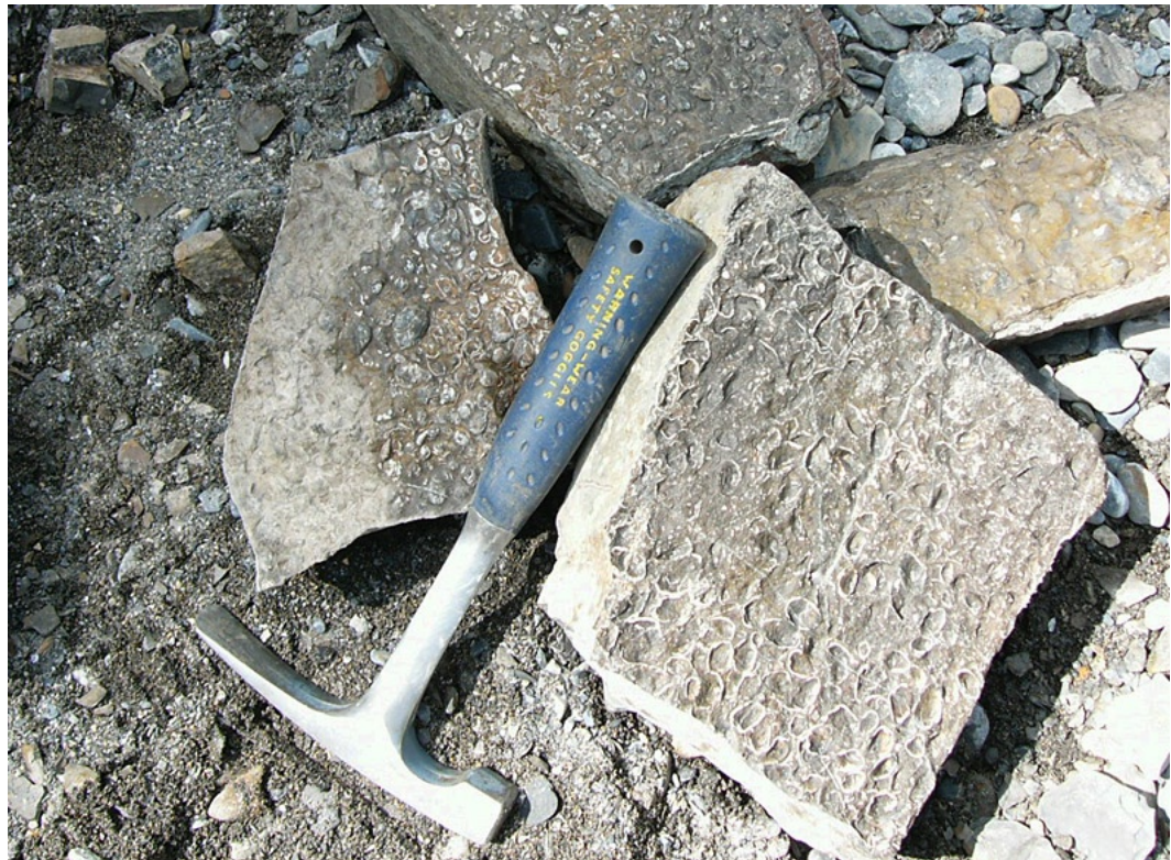
Figure 4. Bivalve coquina ( Corbicula sp.), Lower Cretaceous Moosebar Formation, Bighorn River canyon. These beds are thought to be equivalent to the “Ostracod zone,” an important marker bed in the oilfields of southern Alberta.

Thin, sandy beds in the Cretaceous marine rocks (Lower Moosebar Formation, Luscar Group) contained a profusion of Corbicula ( Leptesthes ) aff. C. (L.) fracta (bivalves) and some gastropods (Figure 4). These